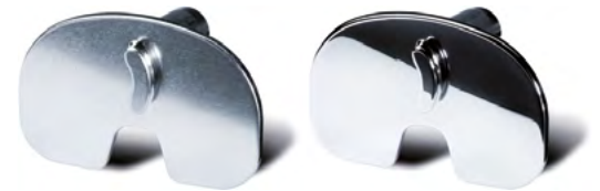
Tibia implants, pre-ground and polished