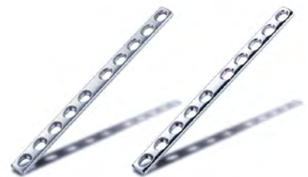
Bone plates, pre-ground and polished