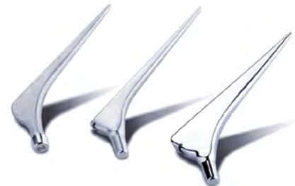
Process steps of a hip implant