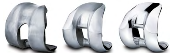
Process steps of a femur implant